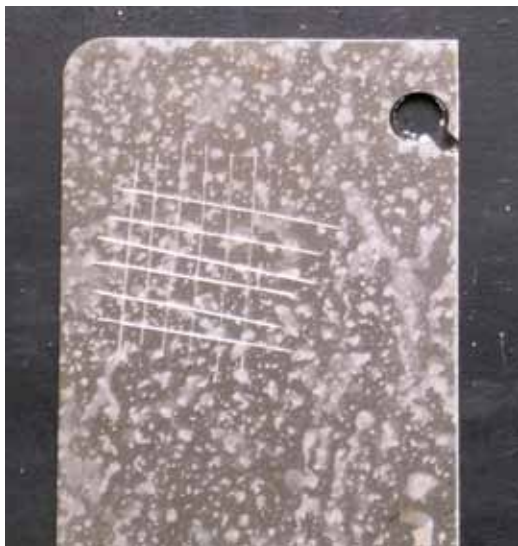
Panel cleaned with VpCI-429 and then coated with VpCI-386 Clear