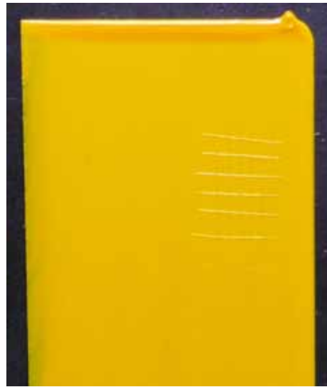
Panel cleaned with VpCI-429 and then coated with VpCI-386 Yellow