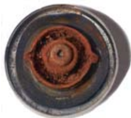
Without VpCI-705 Bio