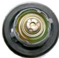
Fuel treated with VpCI-705 Bio